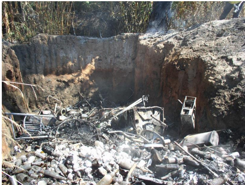
Figure 6 - An example of an illegal burn pit found by District inspectors.

Material cannot be moved to a different property (non-adjointing) to be burned.