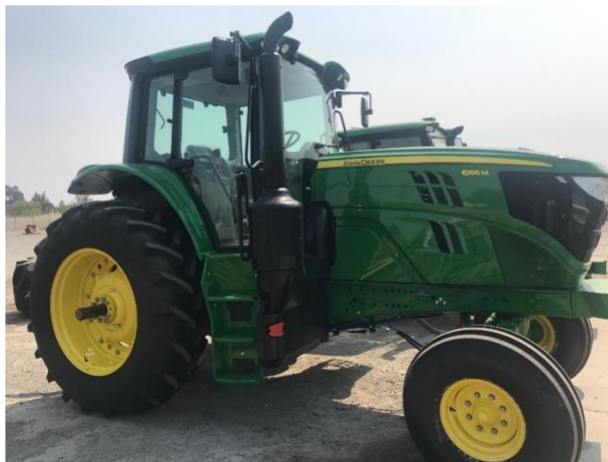
Figure 4 - An example of a new lower emissions tractor partially funded under the District's grant programs.

funded grants. Most of the funding is for agricultural equipment upgrades and school bus replacements. A list of active grant programs is online at www.fraqmd.org/grant-programs .