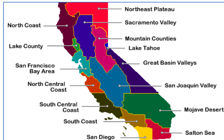
Figure 2 – Map of California Air Basins