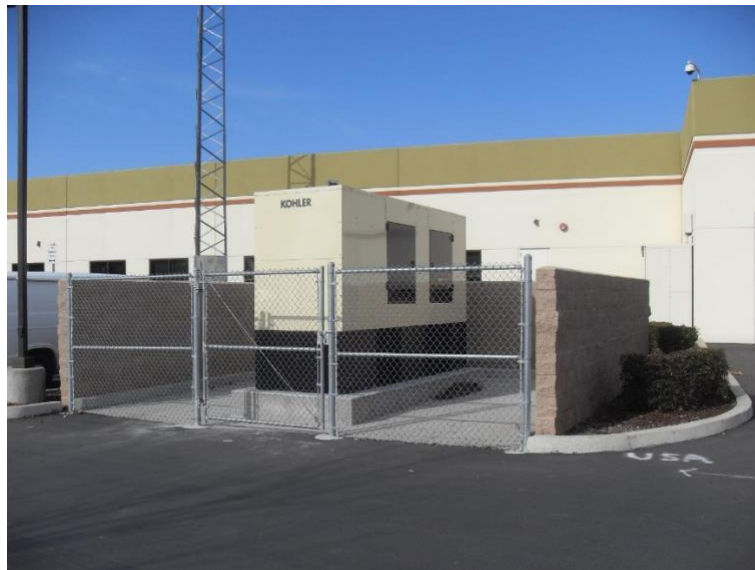
Figure 3 - An example of a permitted source (backup generator)

An air district permit must be issued prior to the building or installation of a regulated device. A permit ensures that the device does not prevent or interfere with the attainment and maintenance of any air quality standard, and that the device will comply with the rules and regulations of the District, ARB, and US EPA. Permits are renewed annually and may also be modified at the request of the owner/operator throughout the year.