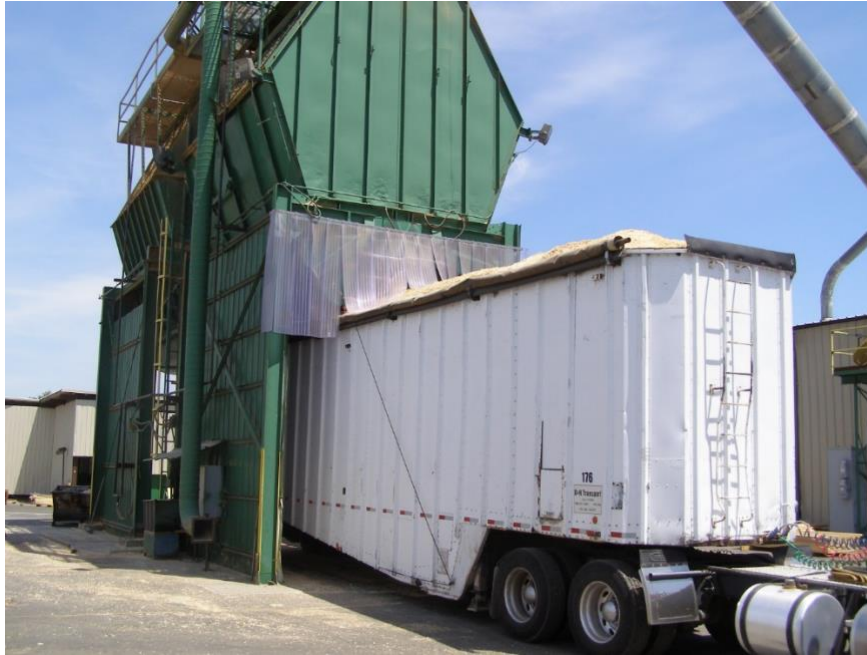
Figure 5 - An example of a permitted source dumping wood shavings into a trailer for reuse elsewhere

The Compliance Division also inspects agricultural engines under the District's Agricultural Engine Registration Program, and portable engines registered in the California Portable Equipment Registration Program (PERP). The District also conducts several inspections under MOUs between the District and various agencies, these include landfills, gas wells and some toxic cleanup sites at Beale AFB.